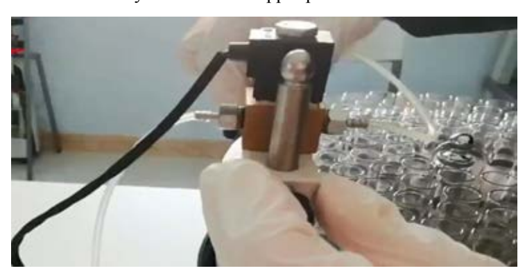
5. The height of silica gel tube is 2-5cm higher than that of test tube

4. Fix the "safety valve" on the upper part of the "vertical bar"