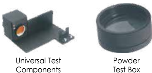
Universal Test Components