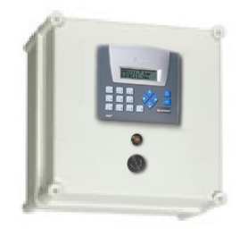
O2 depletion alarm