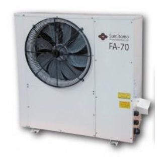
AIR COOLING UNIT